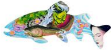
Displayed at: Brio's