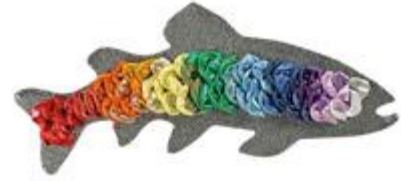
Displayed at: Woodstock Library