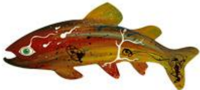
Displayed at: Skinflower Tattoos