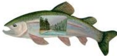
Displayed at: Landmark Café