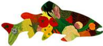
Displayed at: Catskill Rose