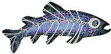
Displayed at: Peekamoose