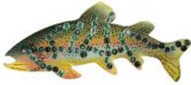
Displayed at: Phoenicia Library