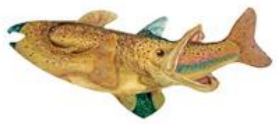
Displayed at: Woodstock Hardware