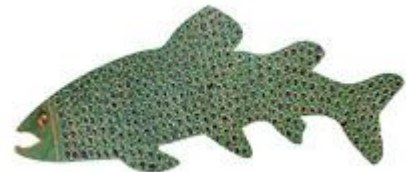
Displayed at: Sweet Sue's