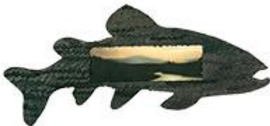
Displayed at: Sweet Sue's