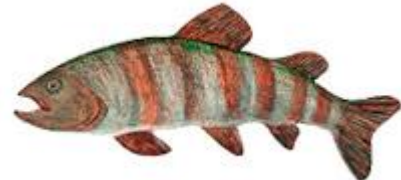
Displayed at: Overlook Mountain Bikes