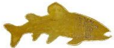
Displayed at: Phoenicia Deli