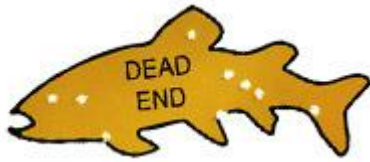
Displayed at: J Rocco's Steakhouse