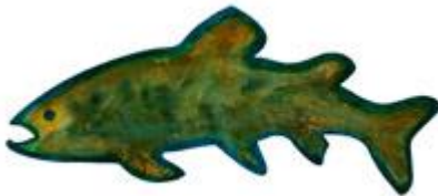
Displayed at: Nest Egg

For additional information and downloadable images, please visit: