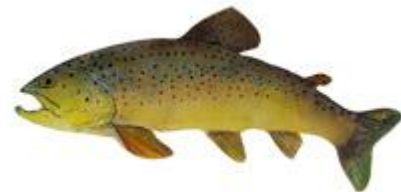
Displayed at: Reservoir Inn