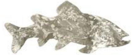
Displayed at: Boiceville Inn