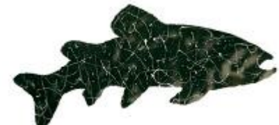
Displayed at: 60 Main