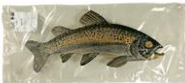
Displayed at: Mama's Boy