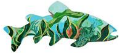
Displayed at: Ulster Savings Bank